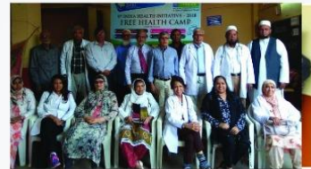
Medical camp 29 Jan 2018