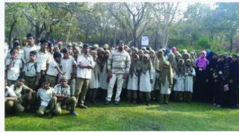
School Kids @Zoological Park