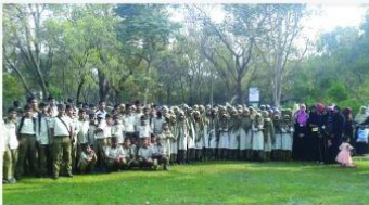
School Kids @Zoological Park