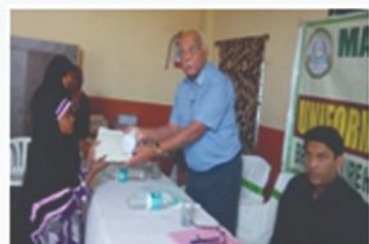
Uniform & Books Distribution