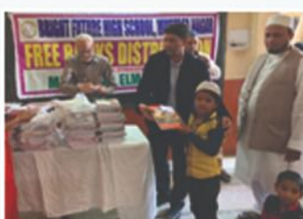
Uniform & Books Distribution