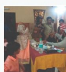
Free Medical Camp