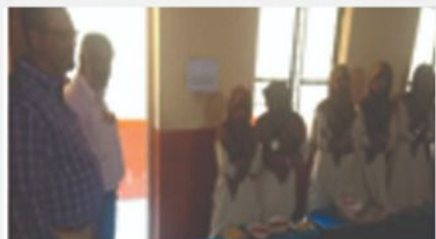
Social Food Event