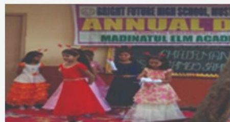
Annual Day Celebrations