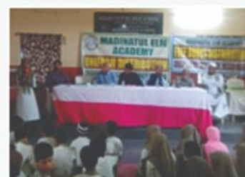
Uniform & Books Distribution