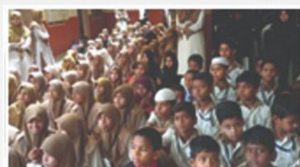
Annual Day Celebrations