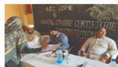
Sewing Center Certificate Distribution