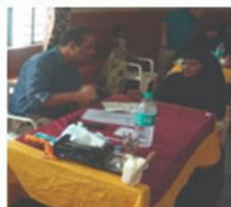
Free Medical Camp