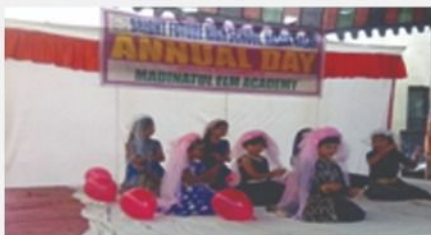
Annual Day Celebrations