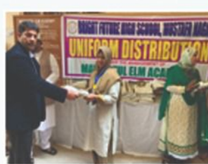
Uniform & Books Distribution